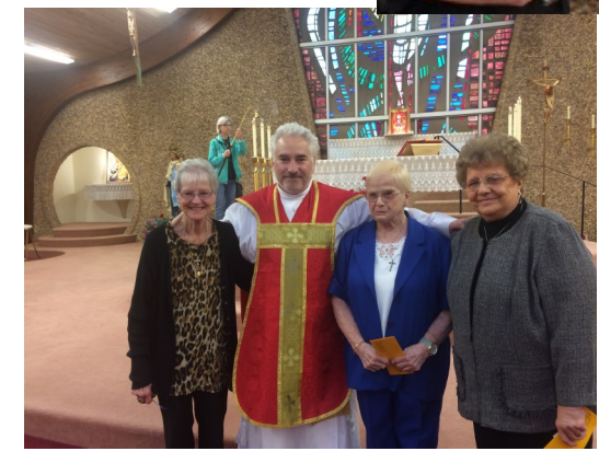
MADONNA/WORD OF GOD LOC AWARDEES