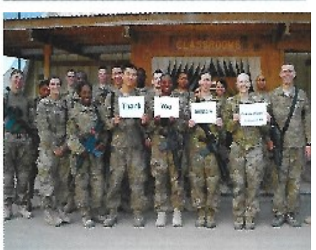
Military Connections Corporation